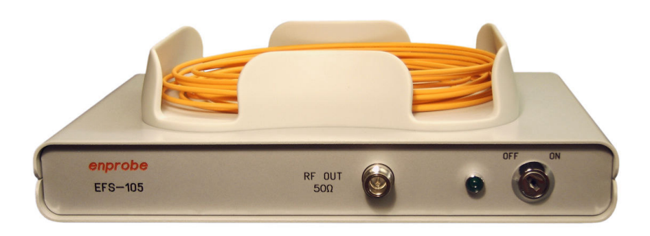
EFS-105 Base Unit

Laser Safety: Laser Class 1, Key Switch, Auto Switch-Off